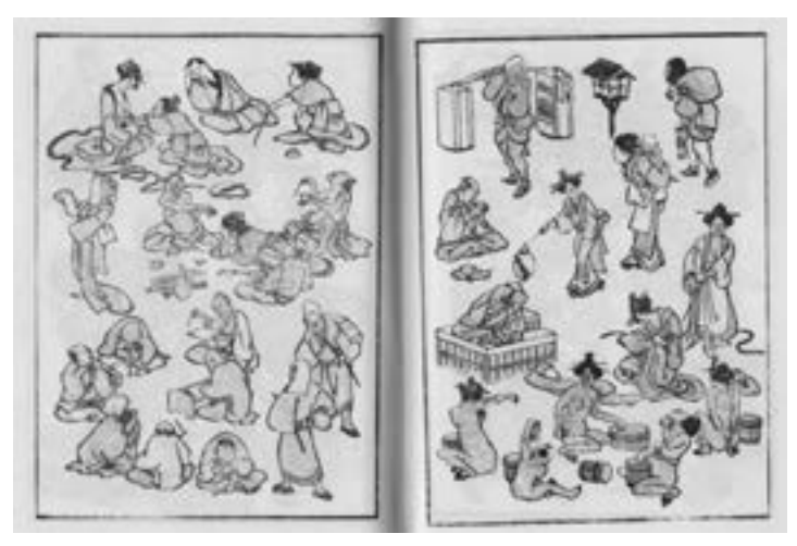
Fig. 4 Katsushika Hokusai, Hokusai Manga , 1814, woodblock printed book, 22.8 x 15.8 cm, Mitsuru Uragami, Tokyo [Nagata, 1986: 32, 33].

Ponchi was derived from the satirical magazine Japan Punch (Fig. 5), published by English illustrator Charles Wirgman (1832–1892) during the Meiji era (1868–1912). The word ponchi began to spread and to be used to refer to satirical drawings or caricatures during this period. After that, during the Taishō era, manga replaced tobae and ponchi as it gradually spread into the publishing community. Therefore, it seems quite understandable that Grosz's satirical work depicting figures and