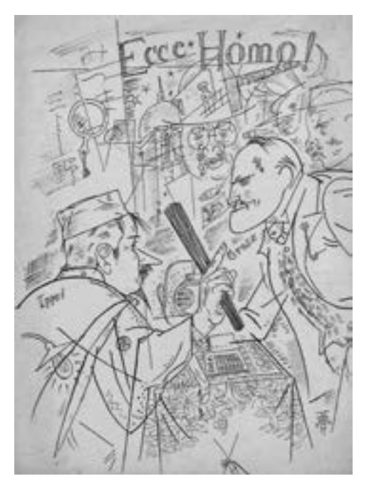
Yanase Masamu, Kono hito o miyo!, 1925, ink on paper, 33.3 x 25.2 cm, Musashino Art University, Tokyo [Yanase 2013: 162, cat. no. 2-2-50].