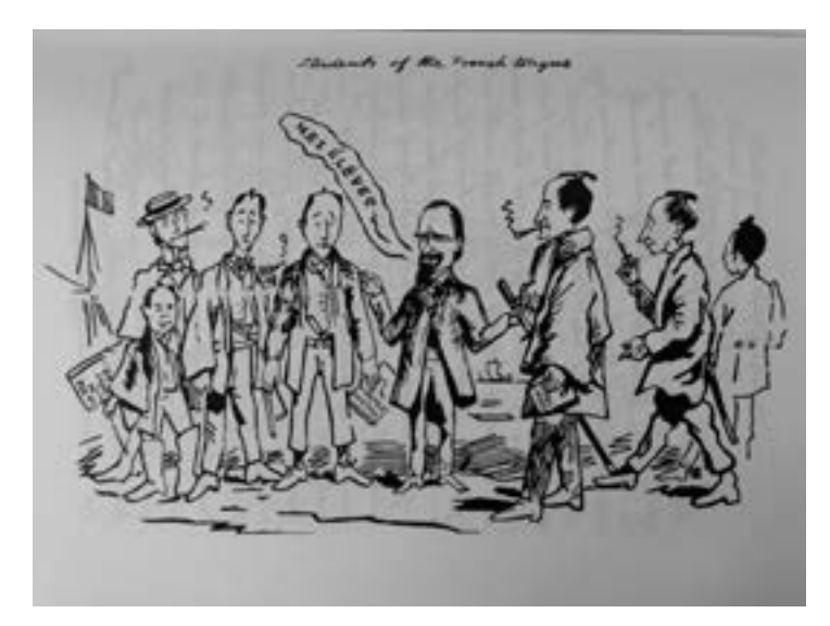
Fig. 5 Charles Wirgman, Students of the French tongue, The Japan Punch, February 1866, 25 x 35 cm, British Museum, London [ Wirgmann , 1975: 169].

Ponchi was derived from the satirical magazine Japan Punch (Fig. 5), published by English illustrator Charles Wirgman (1832–1892) during the Meiji era (1868–1912). The word ponchi began to spread and to be used to refer to satirical drawings or caricatures during this period. After that, during the Taishō era, manga replaced tobae and ponchi as it gradually spread into the publishing community. Therefore, it seems quite understandable that Grosz's satirical work depicting figures and