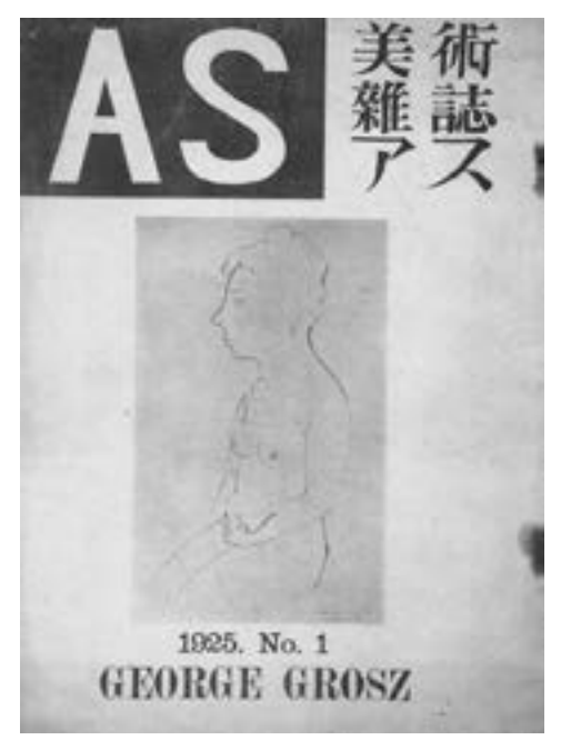
Bijutsu Zasshsi Asu, no. 1, 1925, magazine, 25.8×19.3 cm, Manga Shiryōshitsu MORI [Yanase 2013: 163, cat.no. 2-2-57].