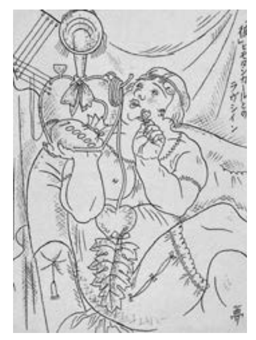
Fig. 2 Yanase Masamu, Kare to modan gāru to no rabushiin, 1926, ink on paper, 22.0×16.7 cm, Musashino Art University, Tokyo [Yanase 2013: 162, cat.no. 2-2-53].